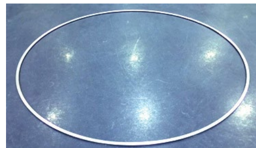
FIGURE 01: LOCATION OF REPAIRABLE SURFACES